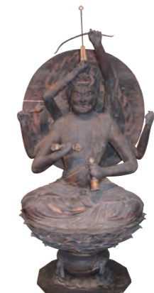
2 Statue of Rgaraja Seated (Important Cultural Property)