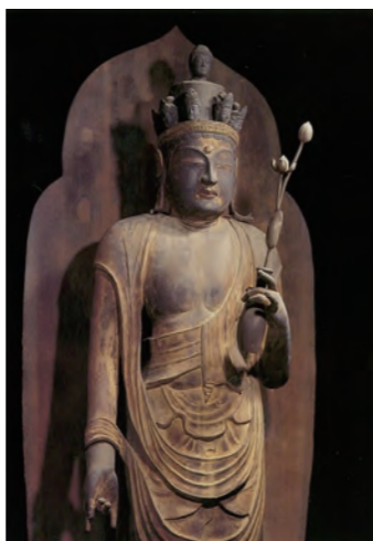
Eleven-faced Goddess of Mercy (Important Cultural Property)

位于本堂的前面的文殊堂是保留了镰仓时代的建筑样式的珍贵建筑物，据说最早是被用作藏经阁。