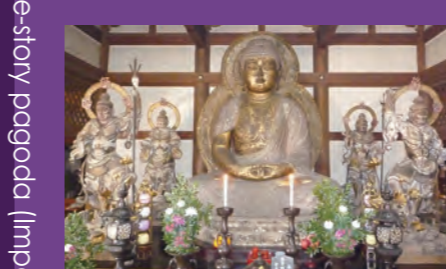
Main Image: Statue of Amida Seated Created in 946, the statue is 3 meters tall, made from a single Japanese zelkova tree. It is representative of Buddhist statues of the tenth century. Housed in the center of the main hall, the statue is surrounded by the Four Heavenly Kings. 主尊阿弥陀如来坐像(重点文物) 946年创作。像高3米，由一块榉树的整木制作而成，是10世纪的代表性佛像。安置在本堂正中央，左右陈列着四大天王像。