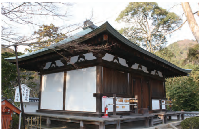
Monjudo (Important Cultural Property)

The Monjudo in front of the main hall is a valuable structure built in the style of the Kamakura period, and it is thought that the building was once the scripture library.