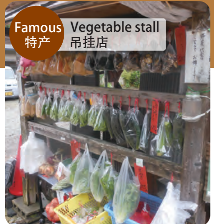
Famous 特产 Vegetable stall 吊挂店

沿着石佛的道路往下走，会看到很多雕刻在野外的佛像，非常有意思！ 当尾自古以来有很多寺院，至今仍遗留着很多摩崖佛像、石佛像。从净琉璃寺到岩船寺之间约2千米的途中，就会看到各种各样的石制佛像。从净琉璃寺出发，会依次看到纤细的“爱宕灯笼”、面带微笑的“弥勒佛”、岩石表面刻着的“不动明王摩崖佛”等。推荐以岩船寺为起点，沿下坡路观看！道路两边还有推销时令蔬菜的吊挂店（无人路边摊）等，在此您可以欣赏到四季不同的美丽山村风景。