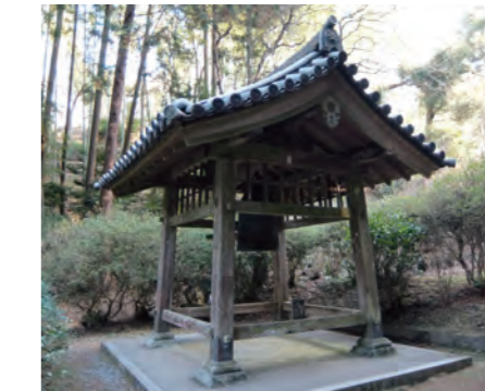
Belfry (Gratitude Bell) Ring once per person.