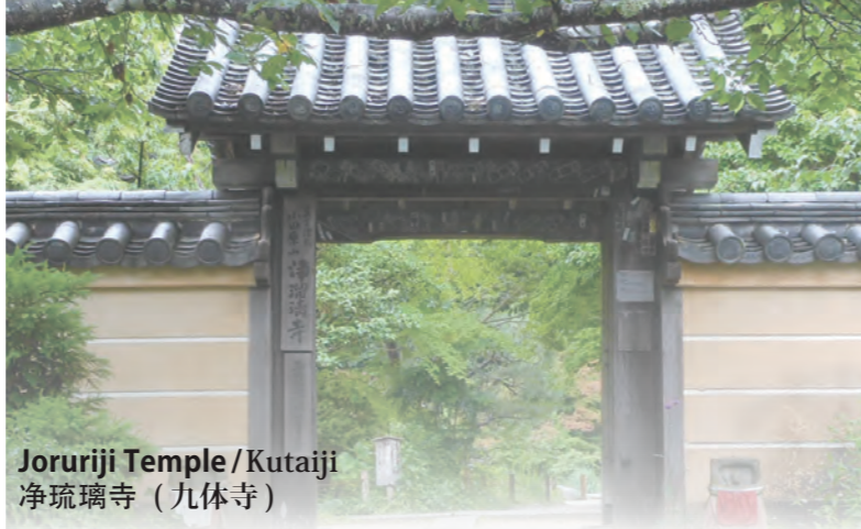
Joruriji Temple / Kutaiji 净琉璃寺(九体寺) No. 16 of the 25 Flower Temples of Kansai 关西花之寺二十五所灵场中第十六号