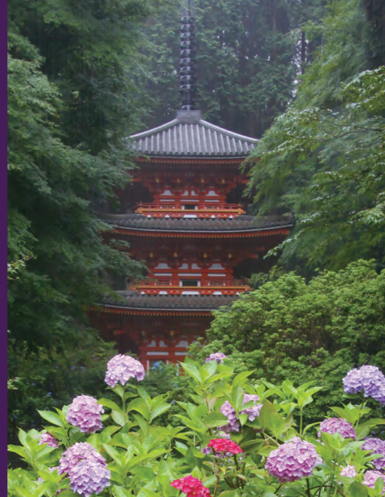
Three-story pagoda of Gansenji Temple (Important Cultural Property) Built in 1442. Repainted bright red during major renovations in 2003. Surrounded by green mountains and hydrangeas during the rainy season, the pagoda creates a memorable contrast. 三重塔(重要文化财产) 1442年建造，2003年大修时重漆为鲜艳的红色。周围山峦葱翠，梅雨季节八仙花盛开，景物相互映衬，给人留下深刻的印象。