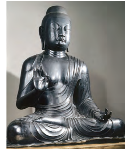
Statue of the Seated Buddha (National Treasure)

The copper statue is 240 cm tall and weighs a little over two tons. One of the few statues from the late Asuka period, it is designated a National Treasure.