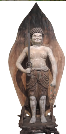
3 Statue of Acala Standing (Important Cultural Property)