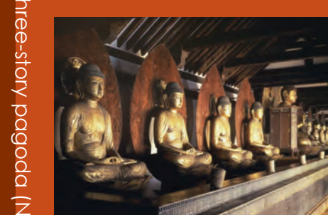
Nine Amida statues (National Treasure) The nine Amida Nyorai statues come from the Buddhist philosophy of the nine stages people must pass to reach enlightenment, and people can pray to a Buddha that corresponds to their present stage. Created in the twelfth to thirteenth centuries (Heian period).