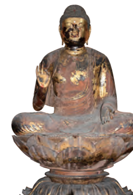
1 Statue of Amida Seated (Important Cultural Property)