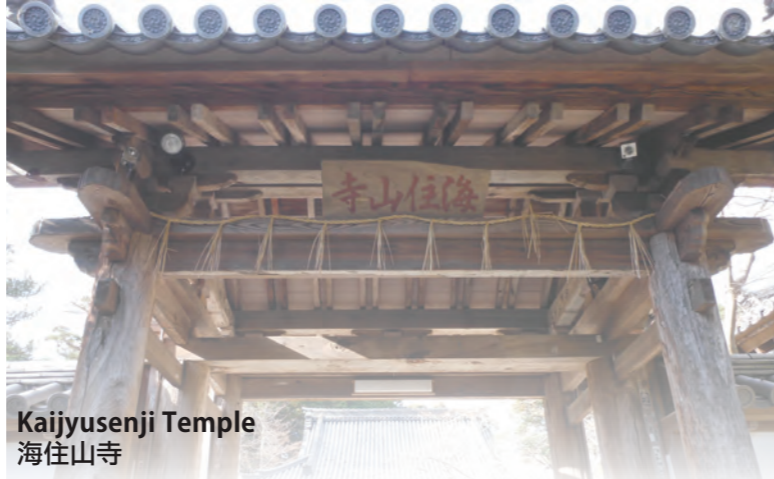
Kaijyusenji Temple 海住山寺