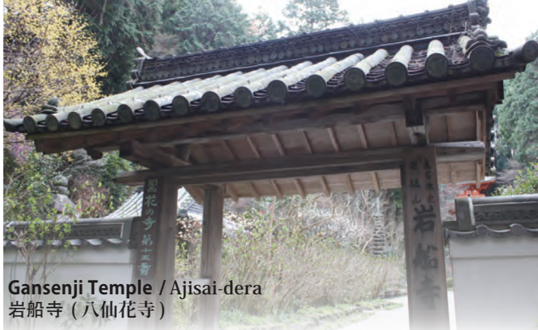
Gansenji Temple / Ajisai-dera 岩船寺(八仙花寺) No. 15 of the 25 Flower Temples of Kansai 关西花之寺二十五所灵场中第十五号