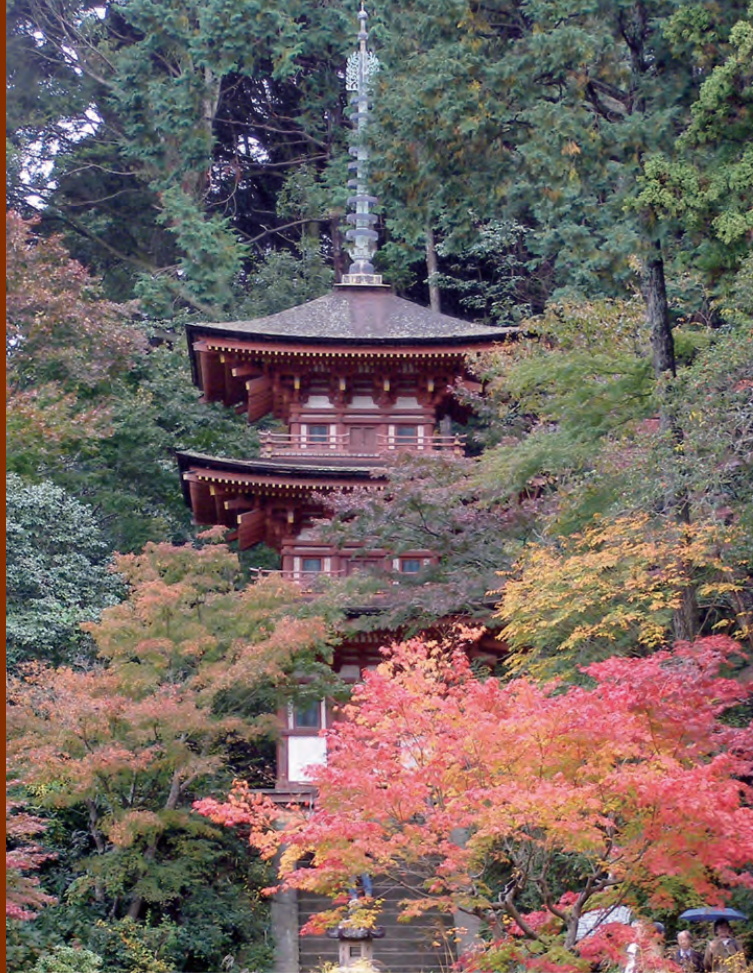
Three-story pagoda of Joruriji Temple (National Treasure) Originally at Ichijō Ōmiya in Kyoto, this Pagoda was moved here in 1178. In the pagoda is the statue of Medicine Buddha (yakushi nyorai), which was the former main statue of worship, along with sixteen arhats illustrated on the inner walls. 三重塔(国宝) 原位于京都一条大宫内的三重塔于1178年迁移至此。塔内供奉着创建时的本尊的药师如来，壁面描绘着十六罗汉。