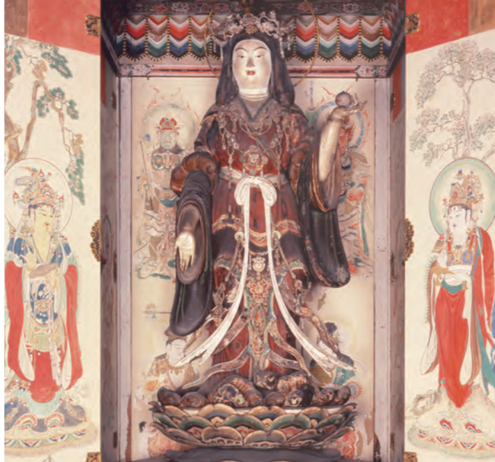
Statue of Kisshō-tennyō (Important Cultural Property) This full-figured Buddhist statue is modeled after a goddess from India. Created during the Kamakura period, this goddess of fortune is famous for her beauty.