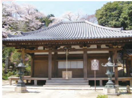
Zaodo, the main hall (Important Cultural Property)

春天到时，寺内的樱花和杜鹃花同时盛开 据说由圣德太子建造。附近的深山一带曾有二十六和尚堂，是修道圣地，但后来全山被烧毁，现在的本堂重建于 1406 年，因藏有许多文物而著名。