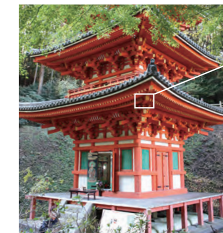
Event 活动 Special opening of first level of the three-story pagoda ( Sanjyu no Tou Shoso Tokubetsu Kaihi ) Early October thru late November 三重塔一层特别开放 10/ 上旬~11/ 下旬