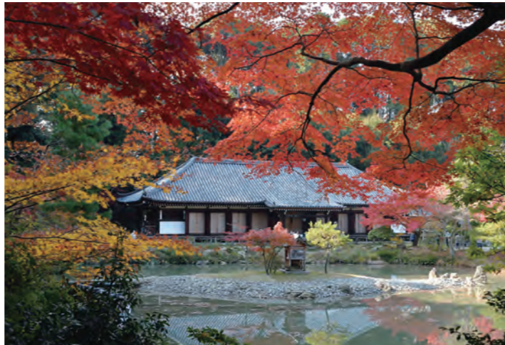
Main Hall (National Treasure) Garden (Special Scenic Beauty and Historic Site) With the pond in the center, the Medicine Buddha is positioned in the east and Amida in the west to depict the Pure Land. The wide main hall houses nine Amida statues.